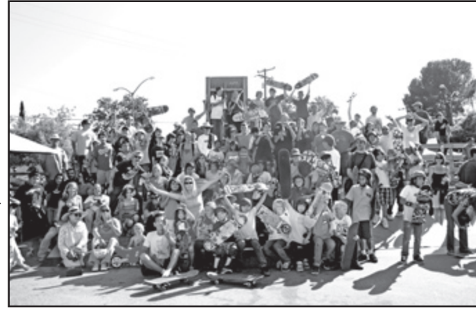
Phantom Victory - Skate Ojai Day - May 31, 2008